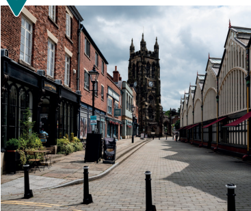
4 Market Place