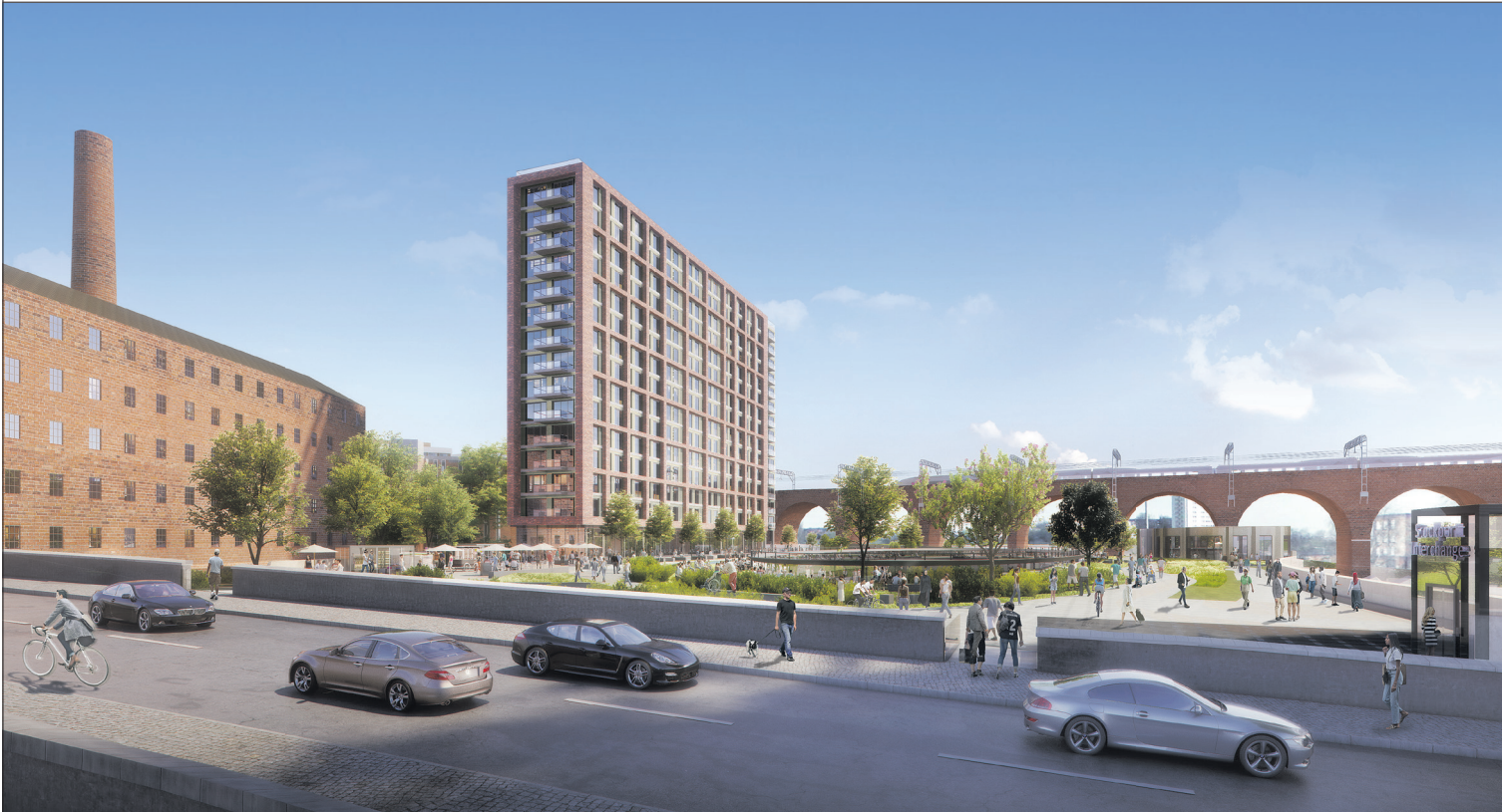
PICTURED Artist's impression of the two acre park at the heart of the Stockport Interchange project.