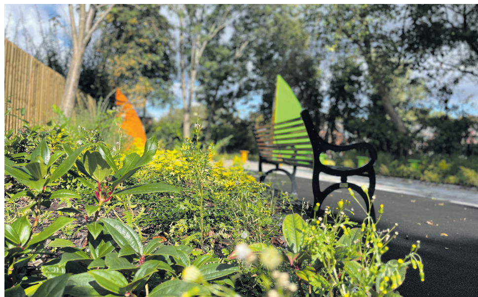
PICTURED Our newest green space, Hopes Carr park

is dedicated to remembering those who lost their lives during the tragedy. There is a running theme of hope throughout the architecture of the park, using the colours of the rainbow to brighten what was once a dark, sheltered space and highlight the significance of hope and strength that have inspired the design throughout.